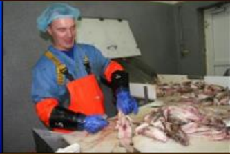
Fish processing and export

Examining human and physical geography of Iceland.