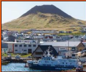
The island of Hiemaey, Iceland