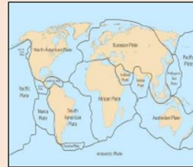
Tectonic plates of the Earth's Crust