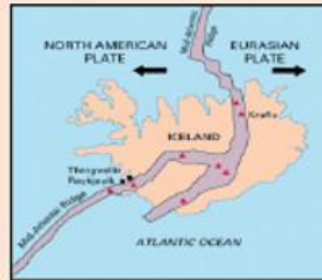
The Mid-Atlantic Ridge