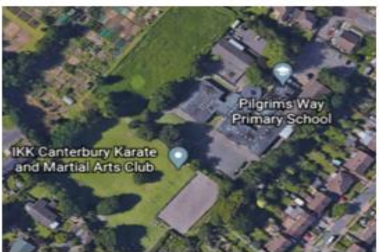
Ariel view of our school and surrounding area