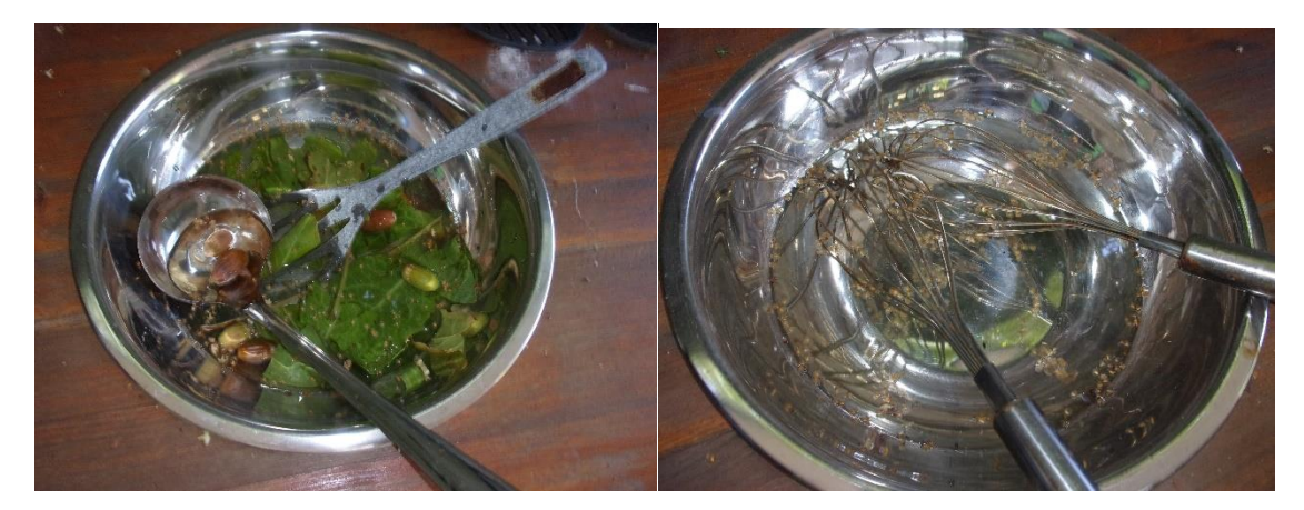
We use the large bench to explore natural materials, create rubbings using leaves and fantastic pieces of art using lots of the treasures that we find on our walks.